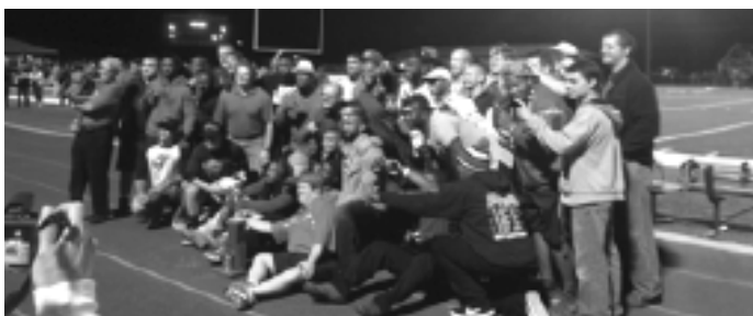
2004 State Football Team