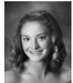
Kayley Tepe Cross Country Diving Track Florida International University