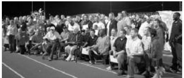
Captains from 1938-2009 present at Alumni Night, September 26.