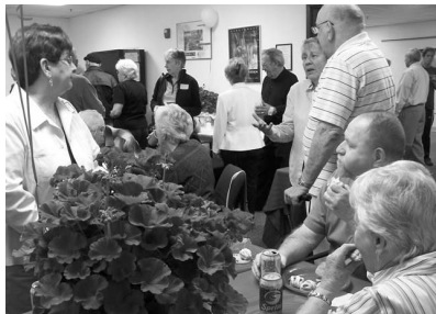
Graduates from 1951 through 1954 enjoy a Luncheon Reception.