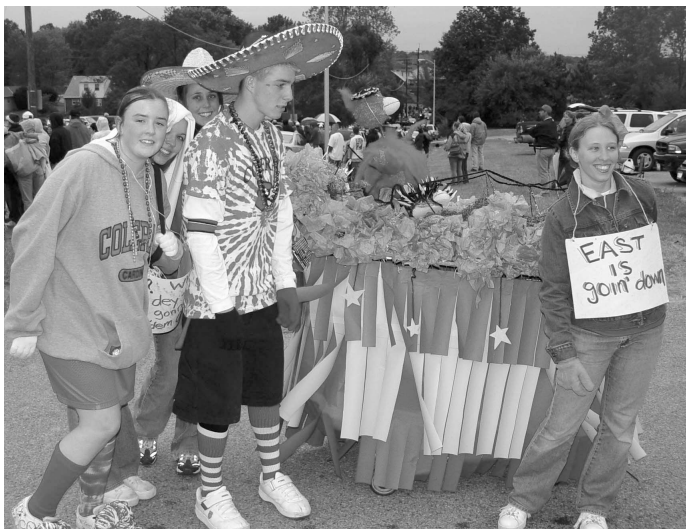
Good times at Homecoming!