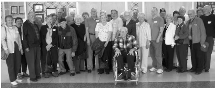
1951 through 1954 graduates who attended the Teach-In.