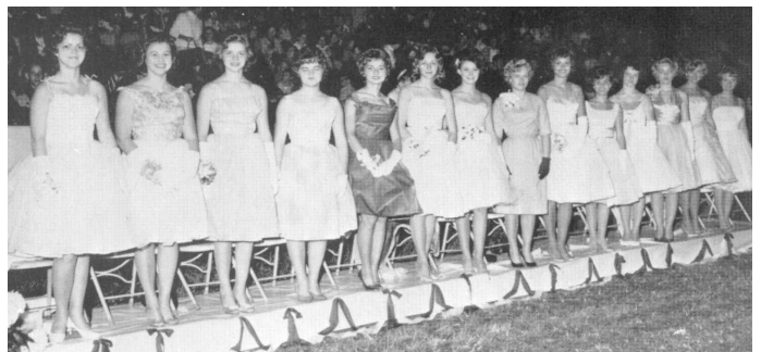
Can you name the ladies of the 1962 CHS Homecoming?

This being my first time abroad, everything I have seen and felt has been intensified by my inexperience. I was 22 when I came to Mongolian and recently turned 23. It feels like it, through the fear is gone now. It feels like the best time in my life to be doing what I'm doing. I am thankful for that.