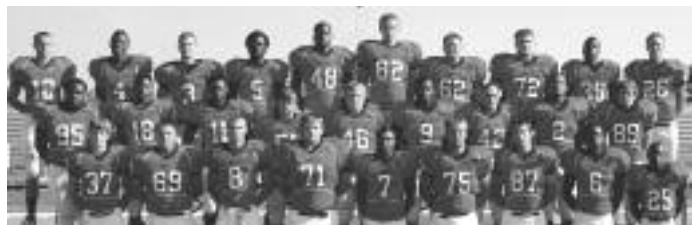
Colerain Football 2009 Senior Players

On September 6, 2009 the fighting Cardinal football team was on national television. The 12:00 game against Elder was televised nationwide on ESPN. Unfortunately Colerain lost. There are not many high schools that have the honor of being nationally televised. Way to go Cardinals. The Colerain games were broadcast on radio station 1480.